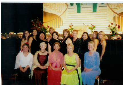
Texas AOII's at the 2005 Convention

For more information about Life Loyal AOII, contact lifeloyalaoii@alphaomicronpi.org .